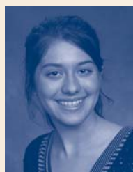
ALEXANDRA BRUNO WALLACE-THOMAS FOUNDATION AWARD