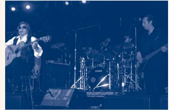
Jose Feliciano and Band

SAVE THE DATE FOR THE 2007 CROZIER DINNER APRIL 21, 2007