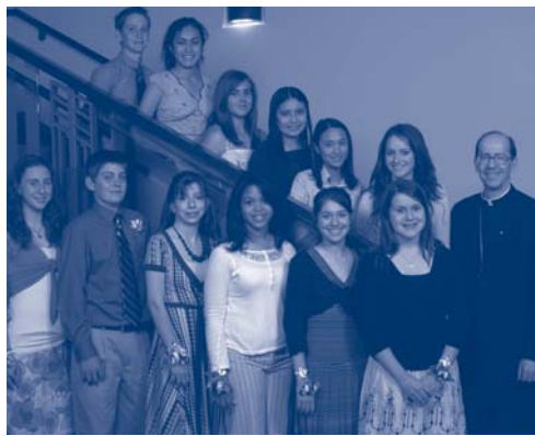
2006 Christian Service Award Recipients with Bishop at April 4th reception