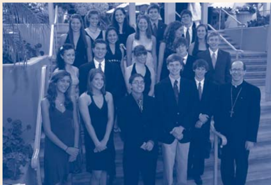
Christian Service Award Recipients Serving as Hosts and Hostesses