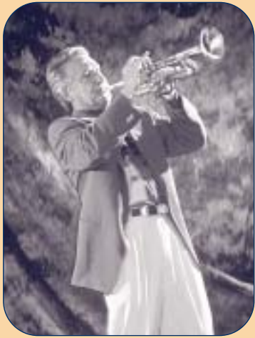
Grammy Award Winner Doc Severinsen headlines at The Bishop's Crozier Dinner