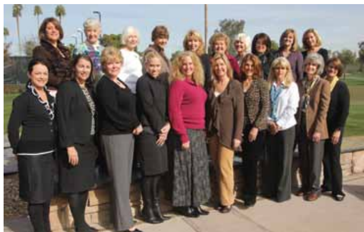
2011 Crozier Gala Committee Members at the Invitation Stuffing on January 8, 2011.

www.blacktie-arizona.com , RSVP Code: Crozier2011, or by sending in your reservation card and check. For more information, please contact the Foundation at 602.354.2400 or visit www.ccfphx.org .