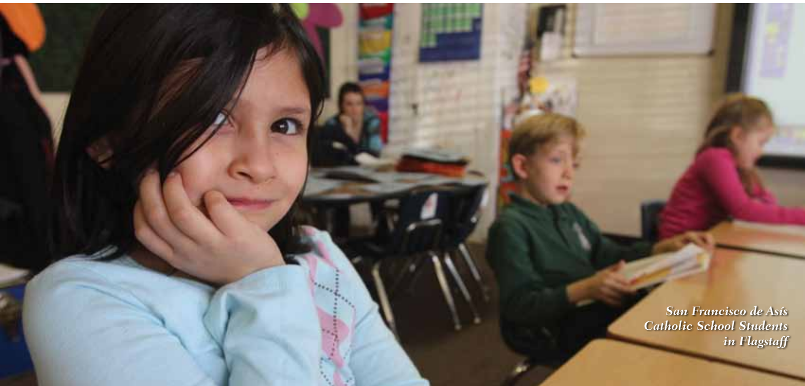
San Francisco de Asís Catholic School Students in Flagstaff